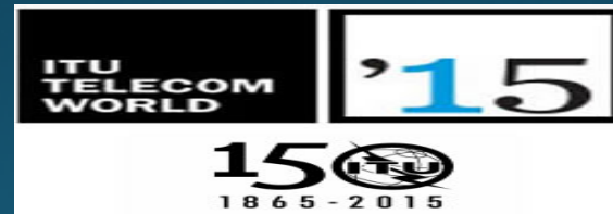
ITU Telecom World 2015 Recognition of Excellency Social Impact