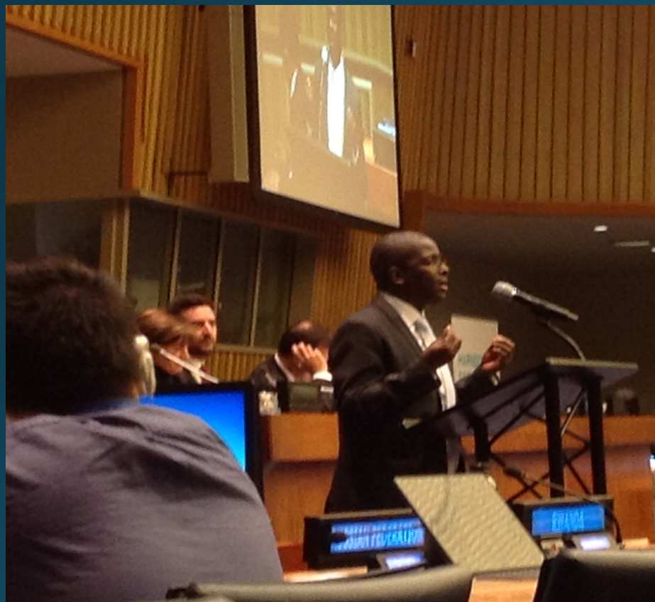
United Nations HQ, may 2017

Among top 12 innovations identified by UN in 2017 to achieve SDGs 2030