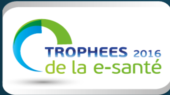
Grand Prize 2016 France e-Health University