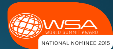
World Summit Award 2015 Best Senegalese App e-Health & Environment