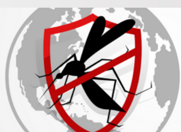
Protecting against mosquito-borne diseases

The spread of Dengue Fever is threatening global health progress, and with almost half of the world's population (about 4 billion people) living in areas with a high risk of dengue, it is critically important to know everything necessary about this life threatening disease.