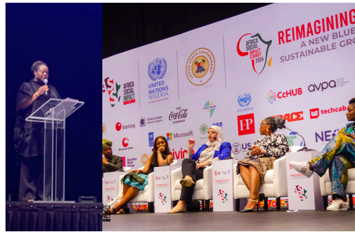
Speakers at the ABCHealth-led panel session focused on private sector perspectives for growing the continent's healthcare space at ASIS 2024 in Lagos, Nigeria