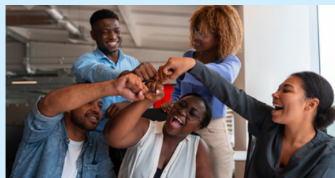
The Benefits of Investing in Workplace Health

In Africa, technology is increasingly becoming a potent tool for enhancing maternal and child health as stakeholders work to improve outcomes in MNCH.