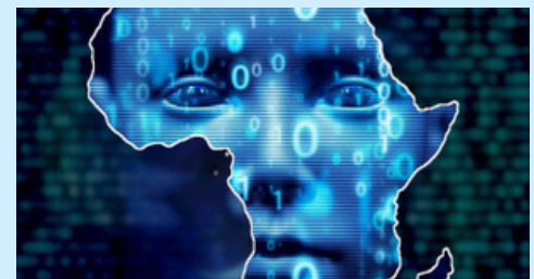
Using AI to Decolonize Health Care in Africa

Africa records over 59,000 work-related fatalities and 4 million non-fatal accidents each year according to the International Labour Organisation.