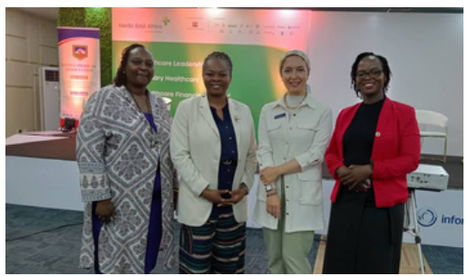
ABCHealth CEO alongside delegates from African countries at the Medic East Africa and Medlab East Africa Conference 2024 in Nairobi, Kenya