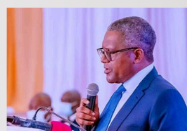
Aliko Dangote heads End Malaria Council in Nigeria

Several diseases that impact the world are spread by the innocuous mosquito highlighting the need to completely eradicate this pest. Here are five simple but extremely effective ways to protect yourself from mosquitoes and to limit your family's exposure to mosquito-borne diseases.