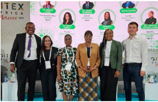
ABCHealth at GITEK 2024 in Casablanca, Morocco; with its high-level delegation of speakers with focus on advancing improved health outcomes in Africa