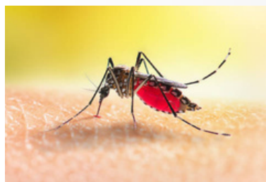
Dangerous mosquito-borne diseases

The miniscule bug responsible for Africa's 'ancient disease' is even more dangerous than most people are aware. Mosquitoes are associated with malaria but these tiny insects are also responsible for spreading various other diseases including Dengue fever, Yellow fever, Zika and a host of others.