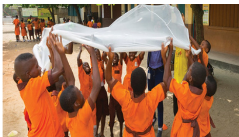
Corporate Alliance on Malaria in Africa (CAMA).

The social enterprise recorded a number of successes in its mandate working across sectors and industries alongside its global development partners who have consistently invested in the welfare of Africans. The move to shut down its operations aligns with its vision to become a truly African-led institution and as such, has transferred some aspects of its work to ABCHealth one of which is