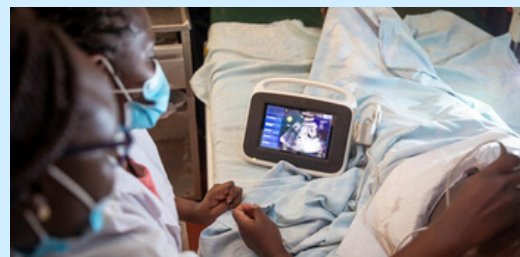
Technology can Improve MNCH Outcomes in Africa

With a lot of warmth from all of us at ABCHealth, we re-affirm our commitment to this course and once again extend our appreciation to all our Partners, Board, Management team, and every stakeholder working with us. Together, we can make Africa healthy and prosperous again.