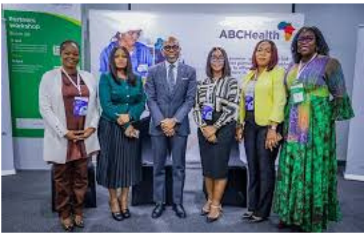
Speakers at the 2024 Medic West Africa in Lagos, Nigeria where discussion focused on mobilizing the private sector to drive health investments in Africa