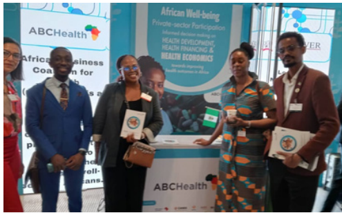
ABCHealth stand at the 8 th Africa Business Forum which held on the sidelines of the 38 th African Union Summit in Ethiopia in February 2025